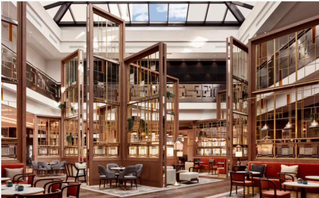
Hilton Vienna Park, a project by Goddard Littlefair

A focal point in the women's rights movement and celebrated around the world, International Women's Day takes place on March 8 every year. In honor of the occasion, Elite Traveler has gathered a list of inspirational and pioneering women in the field of luxury design. Challenging inequalities and inspiring others, these creatives range from top studio designers, business owners and mentors for future generations – and they are all women in design that you should know.