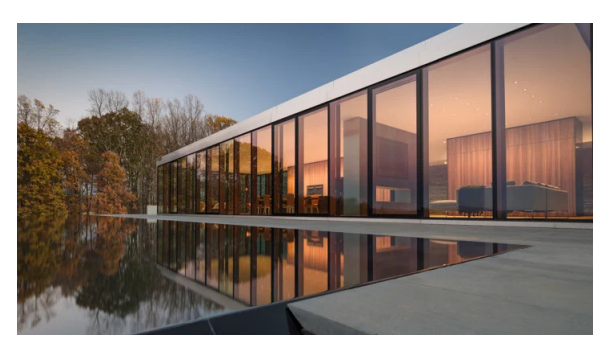
Wildcat residence, a reference project by Lucifer Lighting