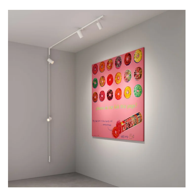
Track by Lucifer Lighting

Lucifer Lighting, a family-owned producer of advanced lighting products for architects, retailers, and institutions worldwide, recently showcased its precision-engineered lighting solutions at Light+Building in Frankfurt. The exhibition featured their current product offering, including Atomos, Cylinder, STELLR, Track, and Fraxion4. Also Lucifer Lighting's latest innovation, the Micro Downlight, was presented in an engaging display where art, design, and light intersect. The exhibition space was conceived by Gensler, an internationally renowned design practice, who previously designed the brand's showrooms in New York and San Francisco.