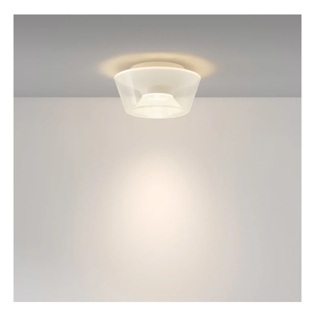
STELLR ceiling lamp by Lucifer Lighting

Lucifer Lighting's flagship product, STELLR , seamlessly combines architectural and decorative lighting. Since its 2020 launch, it has gathered multiple awards . Its organic shape and minimalist design allow it to function as a high-performance wall, ceiling or pendant lamp.