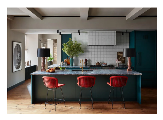
West Village Home, a reference project by Lucifer Lighting