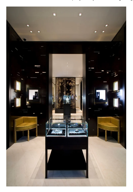
Chanel Madison Avenue, a reference project by Lucifer Lighting