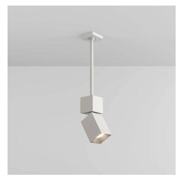
Squylinder by Lucifer Lighting.

The Cylinder spot is the ideal solution for highlighting art, objects, areas and architectural details. Its minimal cylindric design is extremely versatile and it can be applied for dry, damp and wet surroundings. Versions of Cylinder include surface mount, unibody, wallmount or cable pendant.