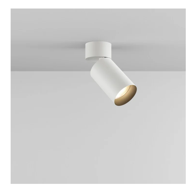
Cylinder by Lucifer Lighting.

The Cylinder spot is the ideal solution for highlighting art, objects, areas and architectural details. Its minimal cylindric design is extremely versatile and it can be applied for dry, damp and wet surroundings. Versions of Cylinder include surface mount, unibody, wallmount or cable pendant.