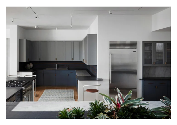
Private residence, a reference project by Lucifer Lighting