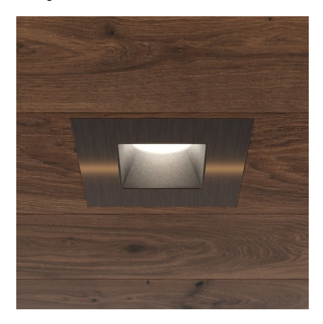
Fraxion by Lucifer Lighting.

The award-winning Fraxion family of downlights now includes the lowest-profile housing, ever in the Fraxion history. Designed for ease of use in shallow plenum spaces and to easily accommodate design changes, this shallowest-in-the-market fixture also offers the smooth, evenly distributed wallwashing designers have been asking for. In addition, generous spacing requirements offer more light with fewer fixtures, making it easier to work with ceiling constraints, while decreasing costs and visual distractions. Available in two apertures, the original 10 centimeter, and now, an even more diminutive 7,6 centimeter.