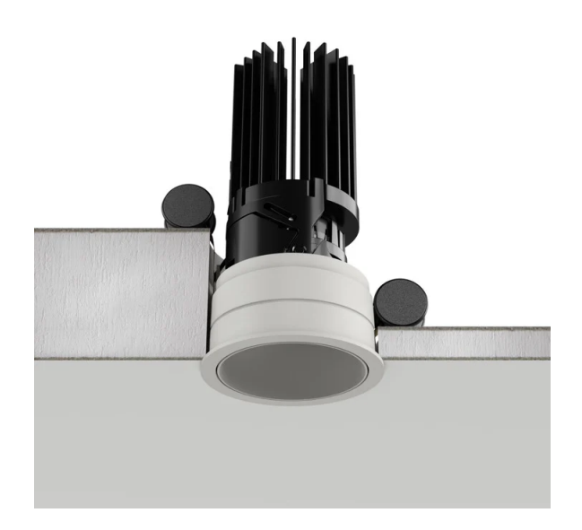
Atomos by Lucifer Lighting

It offers both volumetric and directional lighting with two independently controlled light sources. Like all products in Lucifer Lighting's extensive portfolio, STELLR is designed , developed , prototyped , and assembled at the company's own factory in Salado Creek , Texas . This is where inspiration, engineering, and quality control converge, with a daily commitment to sustainability. More than 150 employees work here using wind energy, xeriscaping, post-consumer recycled packaging and daylighting throughout all buildings.