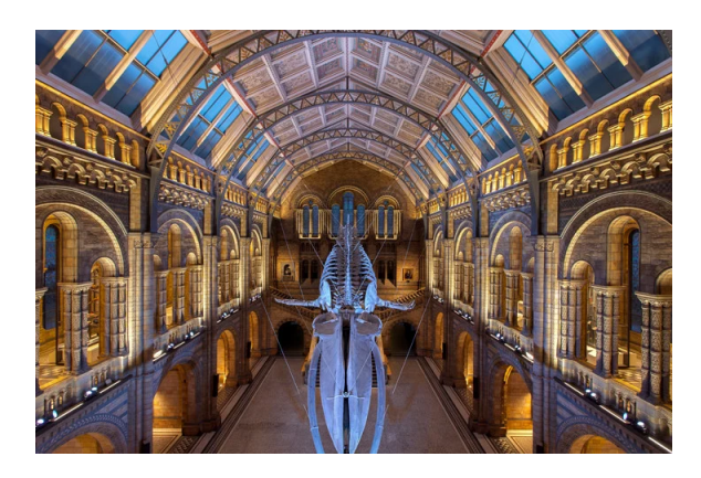
Museum of Natural History London, a reference project by Lucifer Lighting