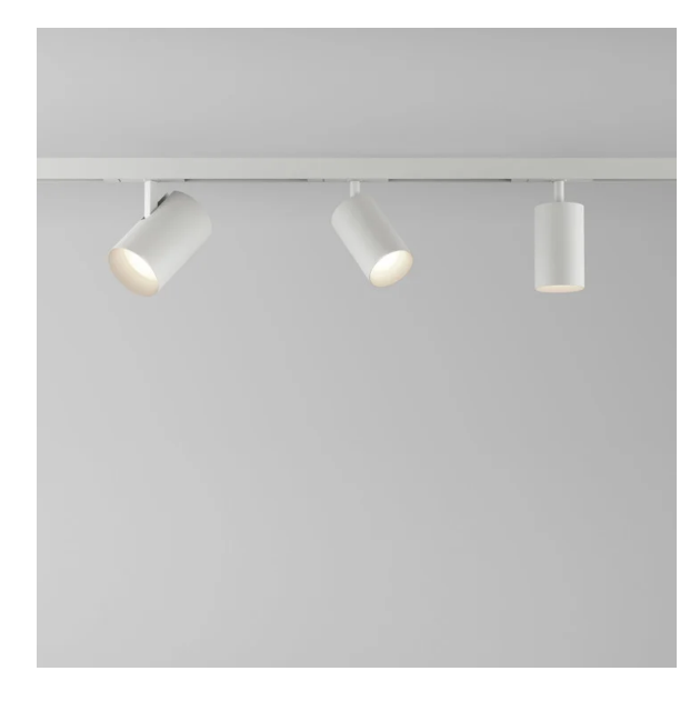
Track by Lucifer Lighting.

The award-winning Fraxion family of downlights now includes the lowest-profile housing, ever in the Fraxion history. Designed for ease of use in shallow plenum spaces and to easily accommodate design changes, this shallowest-in-the-market fixture also offers the smooth, evenly distributed wallwashing designers have been asking for. In addition, generous spacing requirements offer more light with fewer fixtures, making it easier to work with ceiling constraints, while decreasing costs and visual distractions. Available in two apertures, the original 10 centimeter, and now, an even more diminutive 7,6 centimeter.